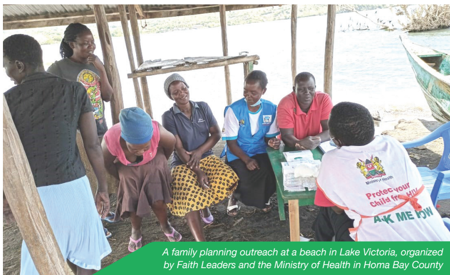
A family planning outreach at a beach in Lake Victoria, organized by Faith Leaders and the Ministry of Health in Homa Bay County