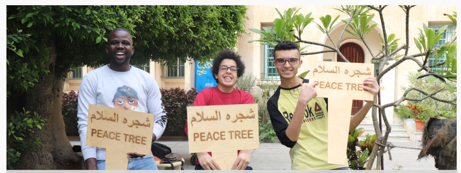
Complete together" initiative focusing on peaceful coexistence under Community Richer In Diversity programme