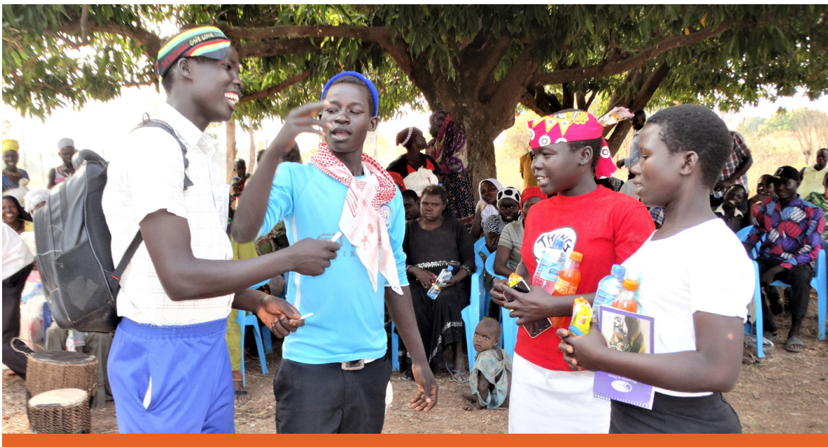
Community sensitization on peaceful coexistence by Muslim and Christian youth in West Nile, Uganda, 2018.

in organizational and capacity development, including resource mobilization. We amplify faith voices, conduct advocacy and communicate messages for change, including social and behavioral change. We collect and disseminate evidence, implement demonstration projects and convene safe spaces for learning.