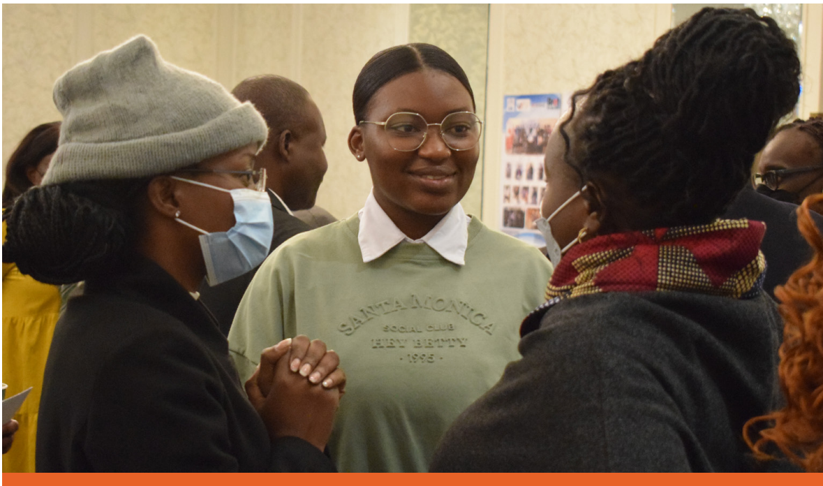
Intergenerational dialogue between young people and faith leaders in Southern Africa

The Network's approach has been independently verified as leading to common engagement and action on Network priorities. Faith to Action Network dialogues are facilitated by eminent theologians from respected faith authorities. Faith leaders are exposed to trends and evidence and learn about religious interpretations and practices within their faith thus reducing misconceptions. This gradually builds consensus and ownership on Network priorities, ultimately sparking greater commitment and constructive action.