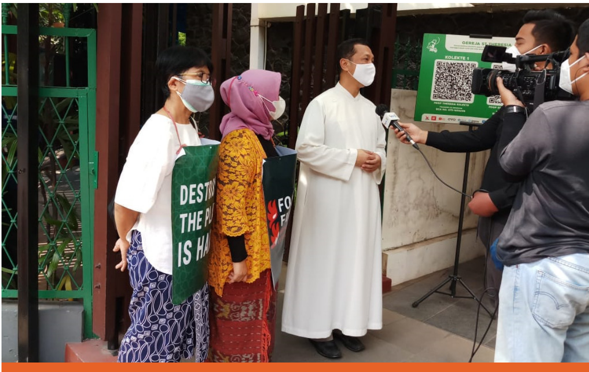
Interfaith advocacy in Indonesia, 2022

One important method for raising faith voices has been the establishment of a regional hub system. Regional hubs enable the Network to activate and mobilize faith actors regionally for joint planning and implementation; quick feedback and consultation; quick response when needed for response to urgent matters. Regional hubs help strengthen the coherence of member and partner actions in countries that are geographically proximate and share many common interests.