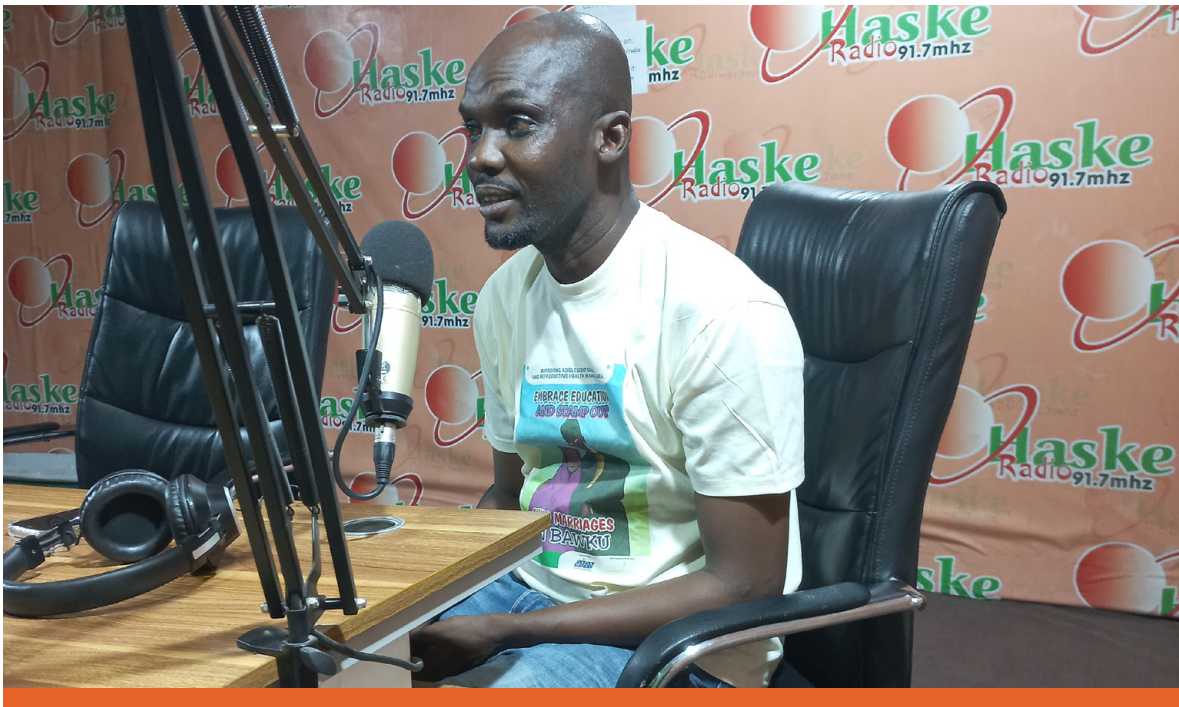
Radio talk-show with Muslim Family Counselling Services in Ghana 2021

Many religions provide people with values offering moral warrants and normative symbols on family health and wellbeing, gender equality