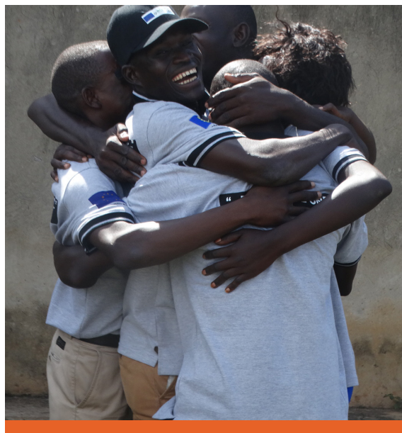
Interfaith and intercultural training of trainers, Yumbe, West Nile, Uganda 2019.

Faith to Action Network to work with all forms of faith institutionalization. Its focus lies not on formal representation and hierarchy, but rather on where it is possible to create change for the better. The Network brings together diverse actors who have one thing in common: a desire for progressive and positive transformation. The Network prioritizes grassroots work to drive change, and we bridge local to national to regional to international for cross-fertilization of ideas and momentum.