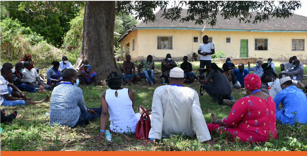
Dialogue between representatives from Giriama African Traditional Religion, Muslim and Christian organisations, Kenya, 2021

The Faith to Action Network works to create safe spaces where people of faith, religious leaders and religious institutions can explore the root causes of intra- and inter-faith tensions that hinder family health and well-being, women's rights and gender justice and peaceful, just and inclusive communities.