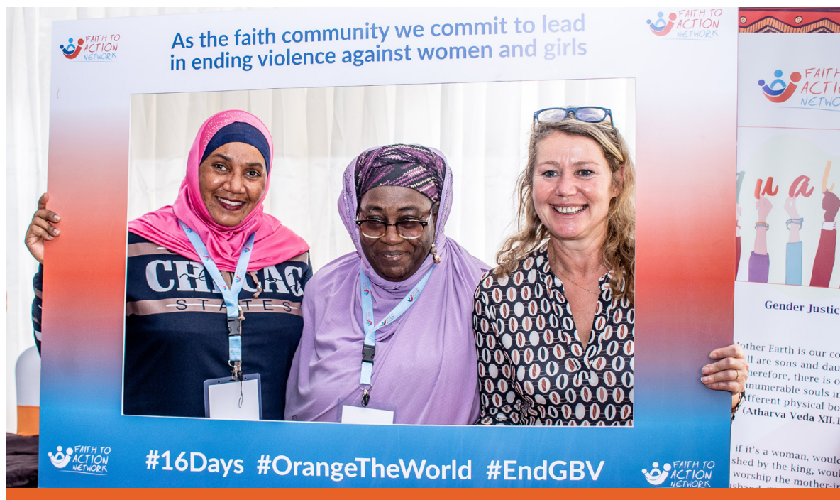
Commitments to ending violence against women and girls, during Faith to Action Network's annual convention, Nairobi, 2021.

Therefore, we seek to promote the positive re-interpretations of sacred texts to reflect the dignity of all human beings. Our communities of faith will continue to strive to teach and exemplify the principle that all people, regardless of sex or gender, are created equal. We encourage our members to reflect on their internal norms and practices, revisit harmful traditions and amplify life-giving norms and practices. Drawing on our moral and physical resources, we champion women's rights and gender equality in laws, policies, societal norms and people's behaviors.