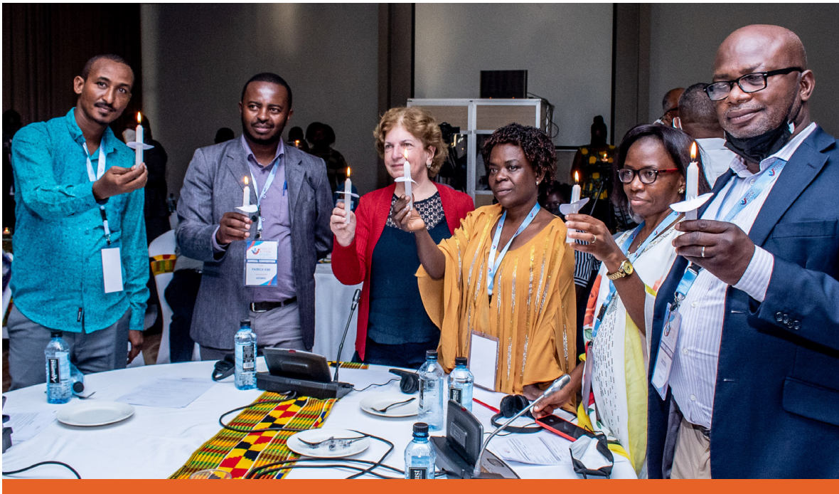
At Faith to Action Network’s annual convention, Nairobi, 2021.

The Network is known for being a southern-born, southern-led global interfaith institution. Its focus on finding constructive, interfaith and intercultural solutions for human needs and rights, bridging disagreement and reducing polarization, is unique. The network and its members have profound experience brokering consensus on family health and wellbeing, championing women’s rights and gender justice and advancing peaceful, just and inclusive societies, which are at the core of the Faith to Action Network identity. Respect is at the heart