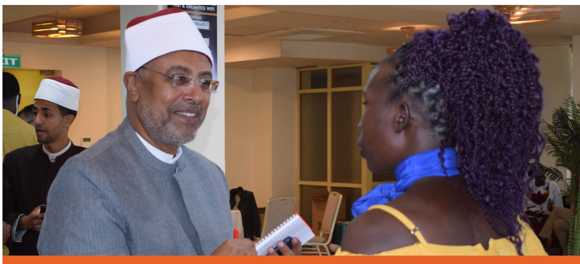
At an interfaith training on positive masculinities, Nairobi, 2022

We adapt our capacity strengthening methodologies to faith organizations' institutional cultures and existing capacity. Using a South-South learning strategy, we facilitate national / regional / global dialogue exchanges among faith organizations, governments, CSOs, researchers and youth to share their experiences, identify lessons and gain skills. We disseminate their experiences internationally and organize faith participation in conferences.