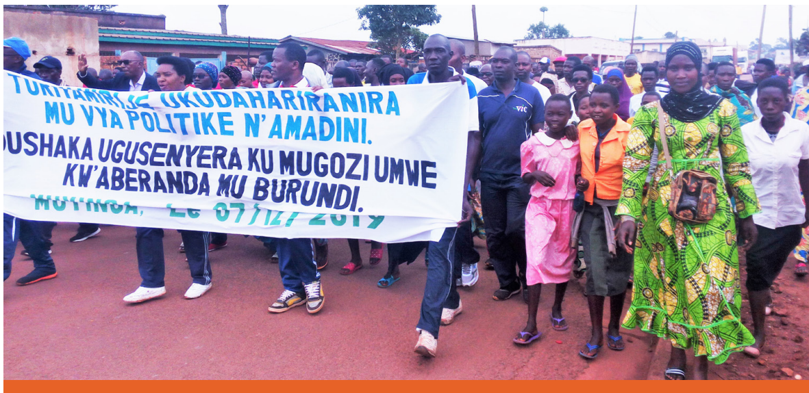
Interfaith peace march in Muyinga, Burundi 2019

The Faith to Action Network sees our “theory of change” as a journey we take with faith actors, faith organizations, faith leaders, faith-inspired decision makers, to advance our mission. The journey is different for each organization, and the Faith to Action Network joins each organization from its starting point. Some are already well along the path, while others are just beginning. We expect the journey to include time for reflection, as well as celebration of successes along the way.