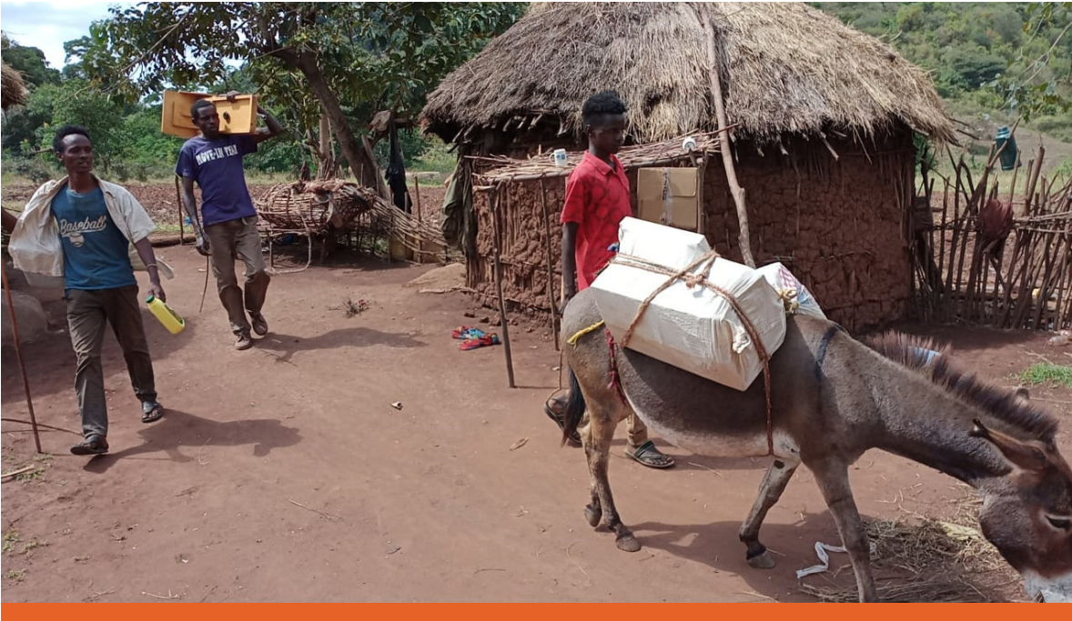
Faith organisation using alternative transport methods to deliver medical supplies in hard-to-reach areas of rural Kenya.