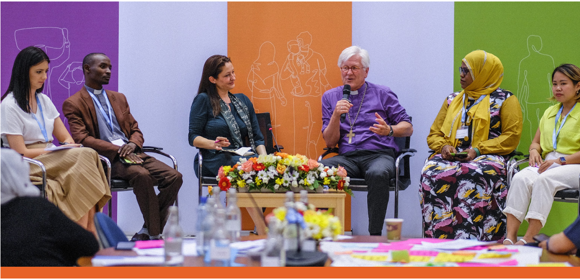
Interfaith dialogue on Welcoming the Stranger, in Geneva, 2022.

We empower women and girls to participate fully in society as actors of change in all areas of life including health, education, peace and protecting the environment