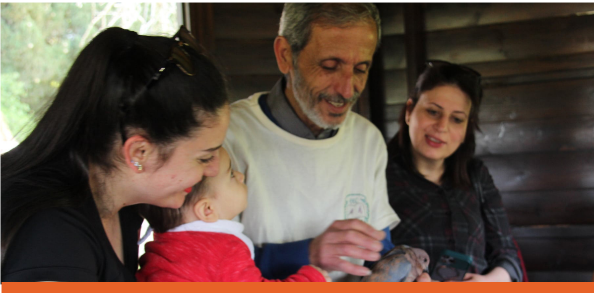
Evangelical Lutheran Church in Jordan and the Holy Land raises awareness about peaceful coexistence.