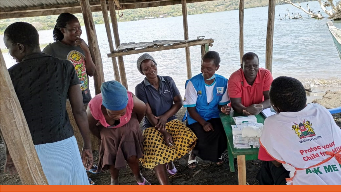
Medical outreach carried out by faith-based health workers at a beach on Lake Victoria's shores in Kenya.