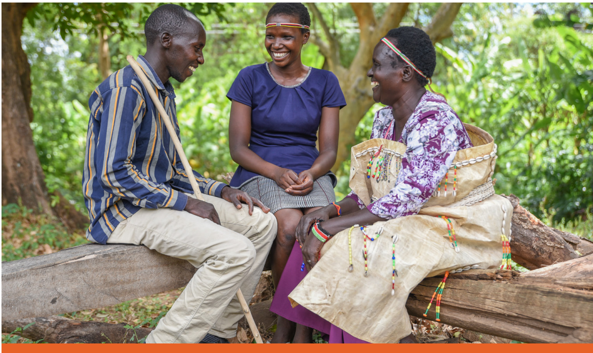
Conversation on family health and wellbeing, Kenya, 2022.

Our faiths encourage all people, including adolescents and youth, to acquire life-giving knowledge. Accessing age-appropriate, accurate and up-to-date information about how our bodies function, promoting healthy sexuality and preventing violence, enables individuals to contribute constructively towards their communities and societies’ flourishing. We encourage our members to seek knowledge and services so that, alongside the teaching of our faiths, they can make informed choices.