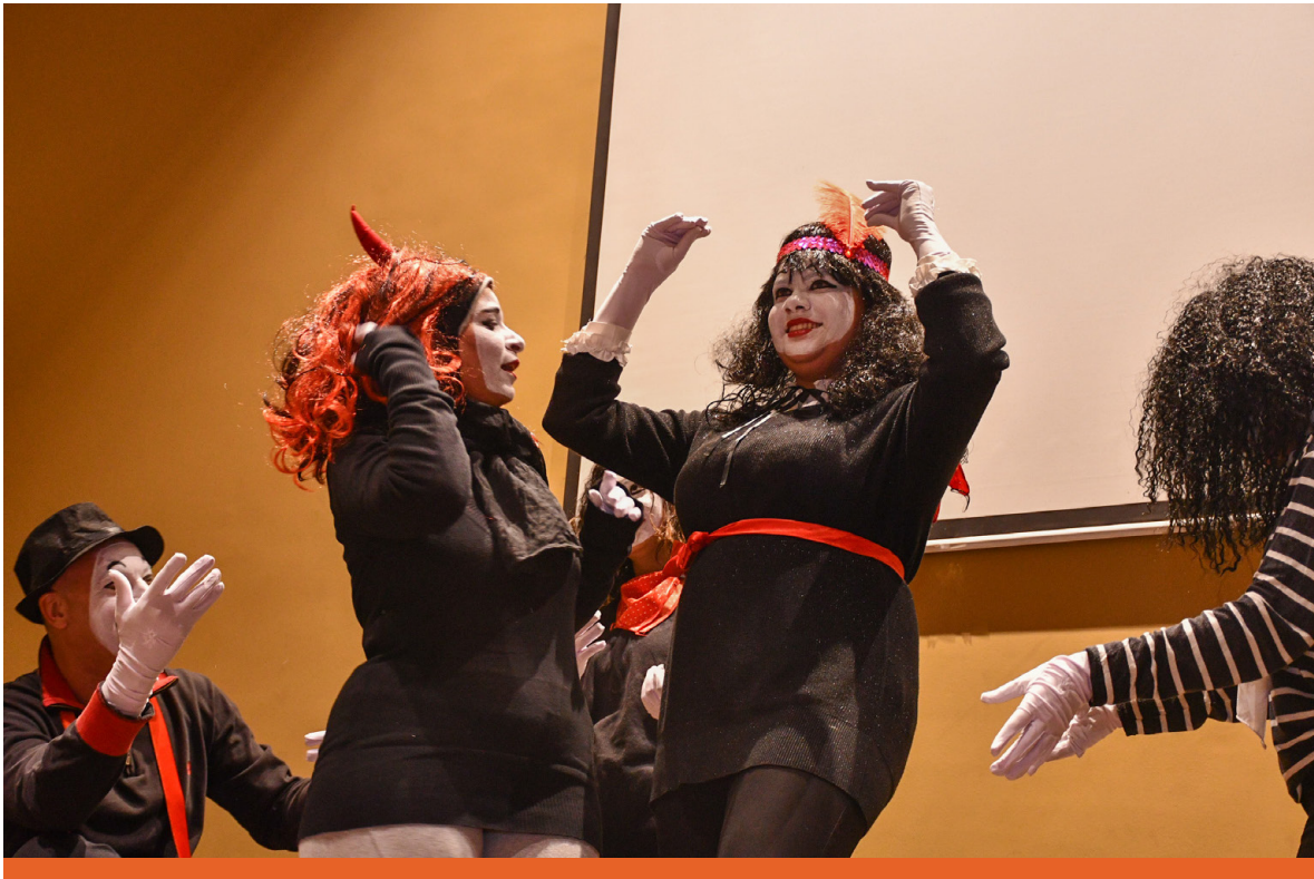
Young people during an interfaith pantomime training on peaceful coexistence, Cairo, 2019.