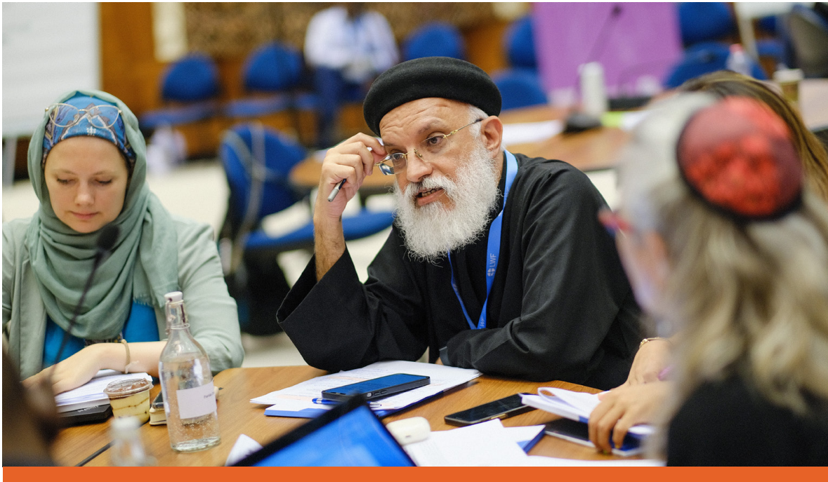
Interfaith dialogue on Welcoming the Stranger, in Geneva, 2022.

Faith to Action Network provides grants to promising interfaith interventions aligned to its core focus areas, led by faith organizations and mobilizing a variety of expertise and actors including cultural actors, actors in the education sector, civil society organizations and local authorities. The grants allow strengthening or complementing existing interventions, and leverage more resources, primarily from faith organizations. Faith to Action Network accompanies its grantees in managing funds efficiently, using project management tools, such as workplans, logframes, and following sound accounting and reporting standards.