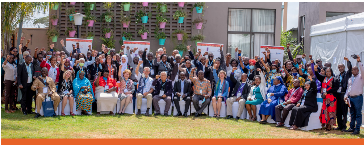
Faith to Action Network 2021 annual convention

The Faith to Action Network's work is managed to standards of international accountability, as assessed by various donors including Netherlands Ministry of Foreign Affairs; European Union; Brot für die Welt / Bread for the World; United Kingdom's Foreign, Commonwealth and Development Office; ACT Church of Sweden among others.