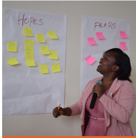
Young women are at the core of Faith to Action Network's Gender Justice Work

Goal 4 8.4. Grow and sustain Goal statement: Faith to Action Network management will grow a trustworthy, inspiring and vibrant interfaith network with transparent, accountable governance and active, engaged members.