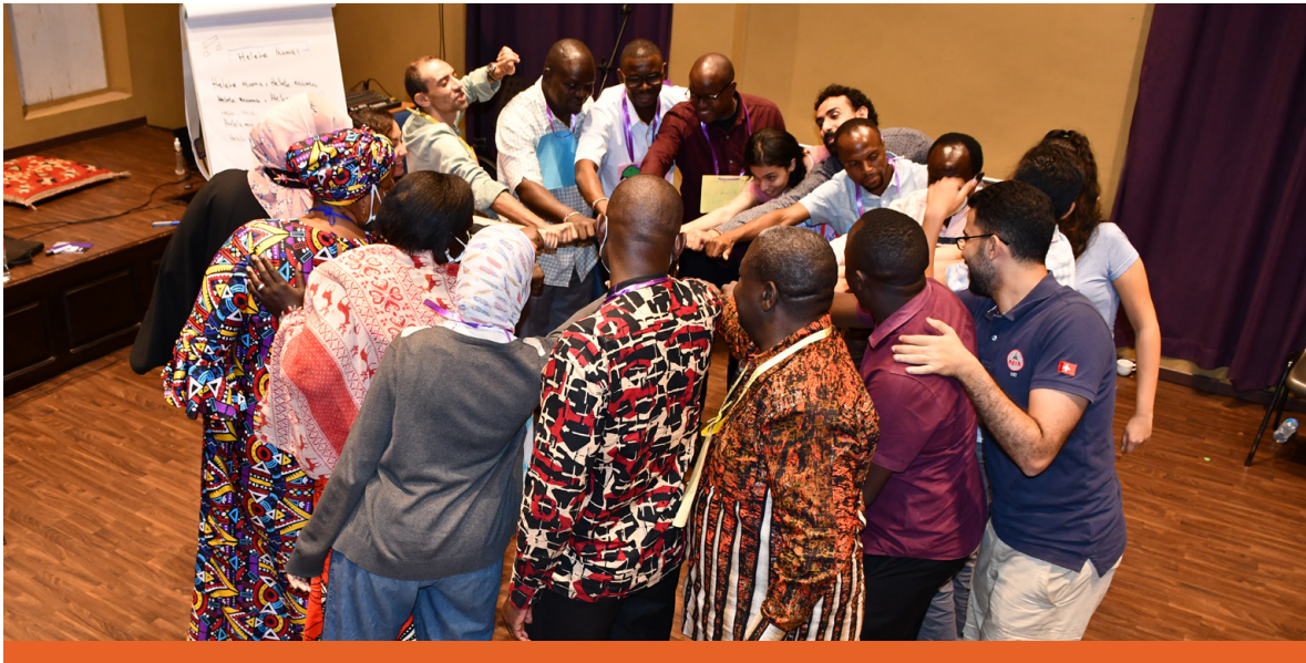
Exchange visit on peaceful co-existence held in September 2021 Cairo, Egypt.

including marginalization and discrimination, human rights abuses, environmental degradation and climate change, deteriorating socio-economic livelihoods.