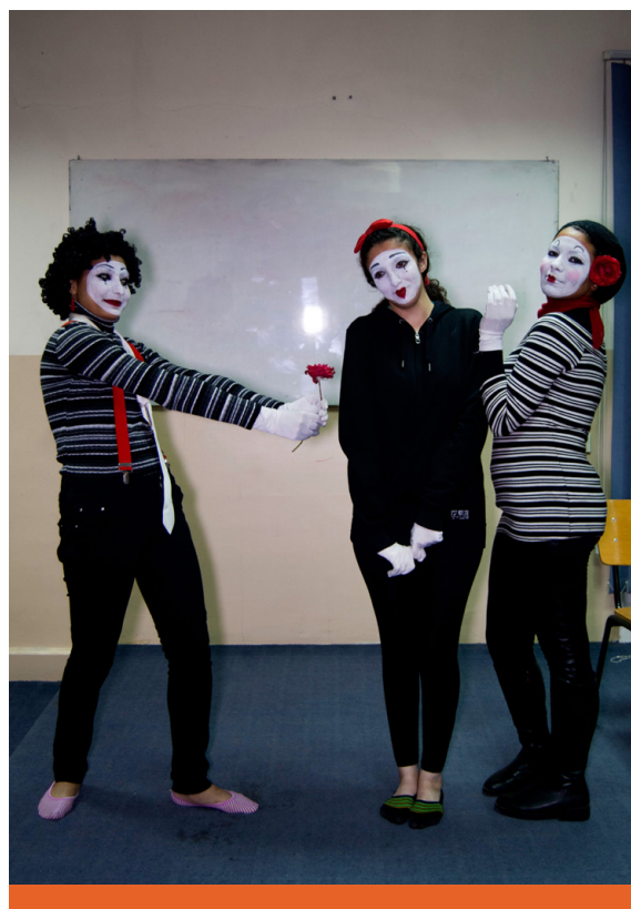
Young people during an interfaith pantomime training on peaceful coexistence, Cairo, 2019.