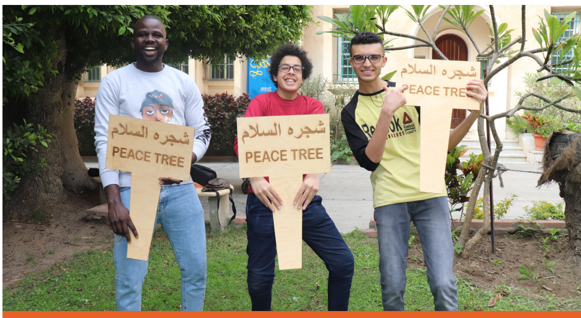
Interfaith actions led by young people, Alexandria, Egypt 2021

The Network secretariat's recent period of rapid growth has demanded increasing clarity and structure for its management structures and operations. The coming five years are important for structuring and putting the remaining elements of its accountable management and governance into place and monitoring their effectiveness.