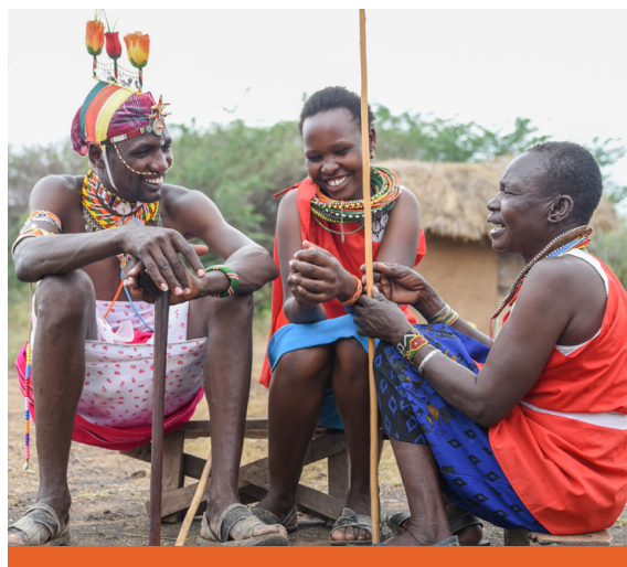
Conversation on family health and wellbeing in Kenya, 2021.

The Faith to Action Network is a trusted partner that is seen as delivering results with a high degree of integrity and commitment to inclusion. It uses both technical assistance and small grants to increase members' institutional resources and effectiveness, helping them have the connections, know-how and skills to engage with international decision-makers for resource mobilization and advocacy. It aims to achieve international standards of professionalism across all its endeavors while retaining effective communications colloquially with members operating locally.